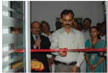
The Eye Bank, Anand Inauguration, June 21

The Sankara Eye Hospital, Anand is granted registration for Eye Bank & Corneal Transplantation by the Gujarat Government. The Eye Bank was inaugurated on June 21, 2010 and is