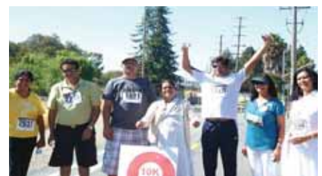
Sevathon 2010 participants