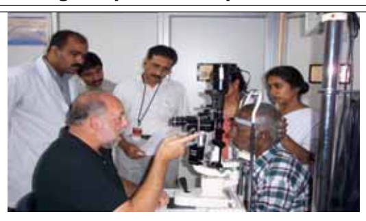
Orbis USA & Sankara

Thillana - A Tamil Lite Music Program in Bay Area at DeAnza College, Cupertino on April 26.