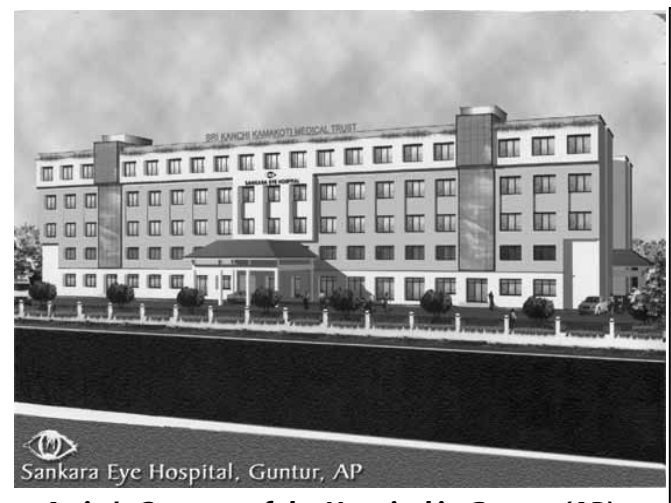
Artist's Concept of the Hospital in Guntur (AP)

$1.25 million : required to complete this hospital.