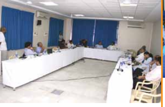
Apex Body meeting with SEF Board